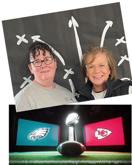
Ag For Autism Bowl Bash 2025